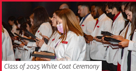
Class of 2025 White Coat Ceremony