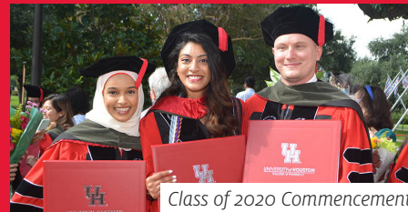
Class of 2020 Commencement

Report to the Texas Pharmacy Congress — Aug. 26-27, 2021