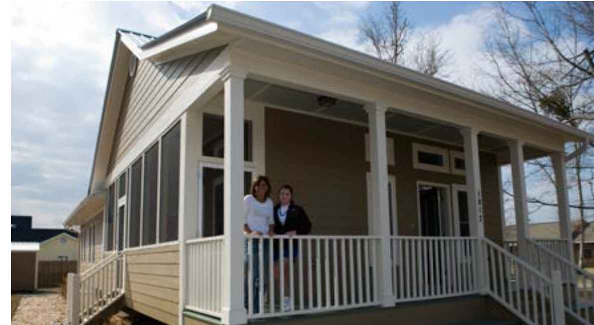
Habitat for Humanity community partners celebrate the completion of their green superhouse.

According to the team, the goal of their project was "to survey Habitat's sustainable practices