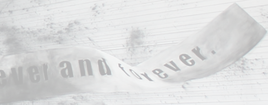
Background art: Shine and Rise (detail). Randy Twaddle, 2007. The Honors Commons.