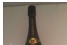
Wine recommendations from the Chronicle's tasting panel