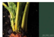
7 great new cookbooks for the avid home cook