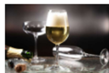
Upcoming Houston wine events