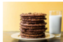
Cooking on deadline: Big Butterscotchy Oatmeal Cookies