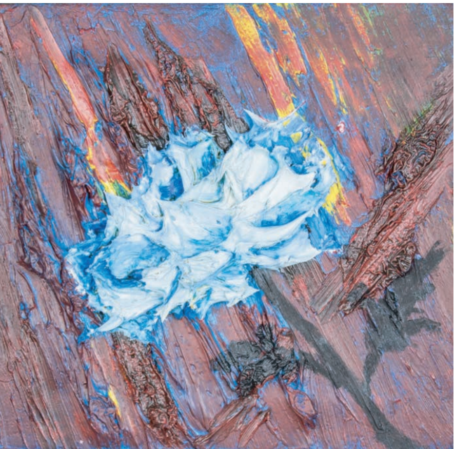
Blue Flower, Oil on Canvas 11"x10", Hanh Tran