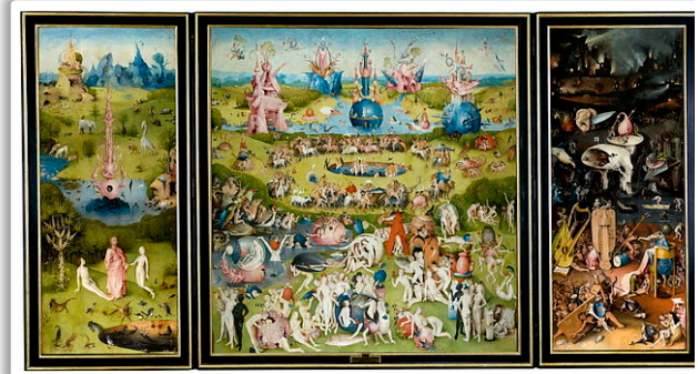
Visit some of the most famous museums in the world, like Madrid's El Prado.