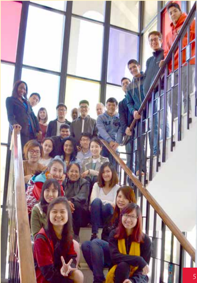
5 C and 5 D