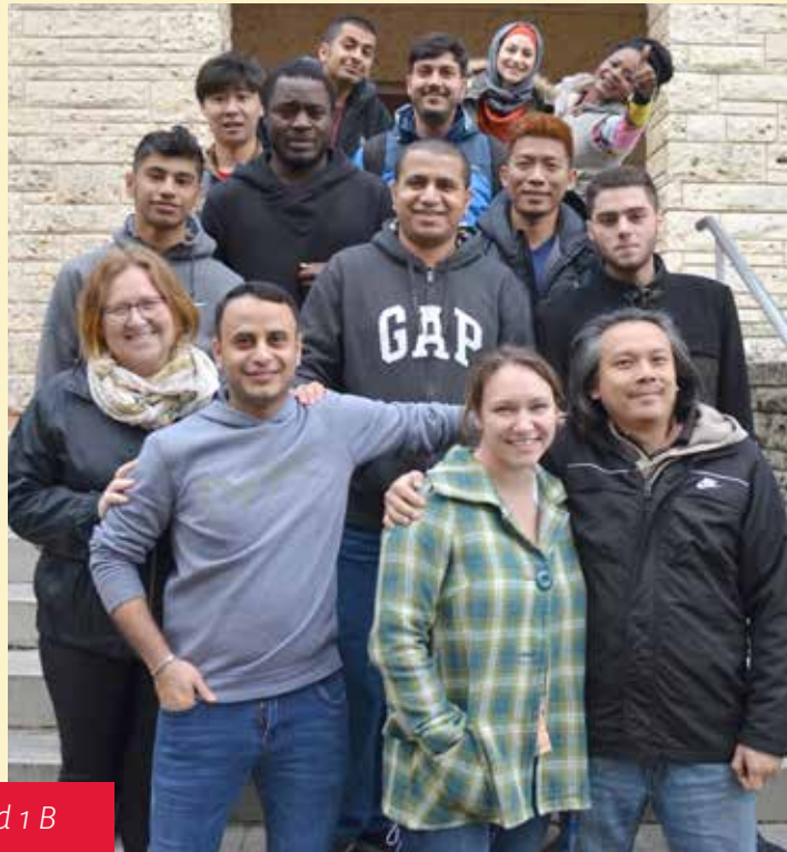
1 A and 1 B