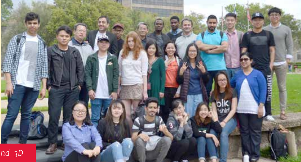
3 C and 3D