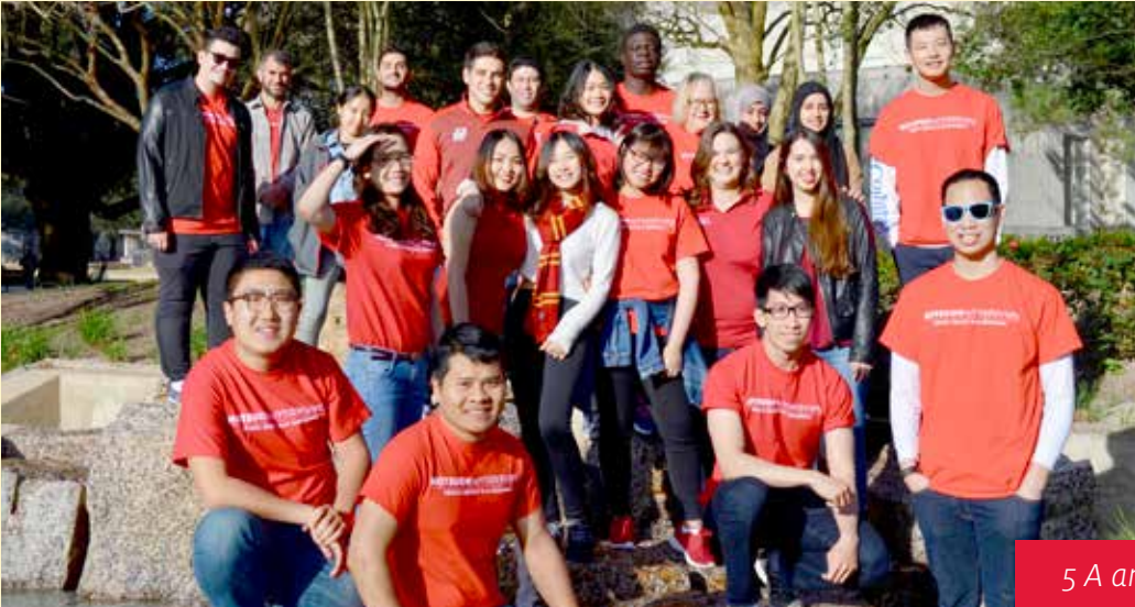
5 A and 5 B