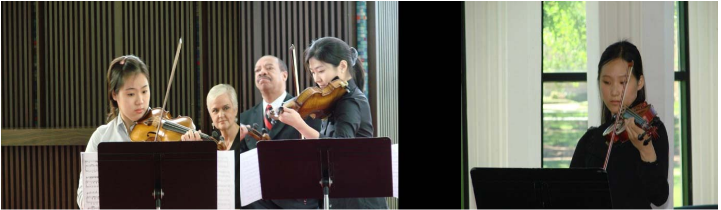
LCC students performing music at graduation ceremonies